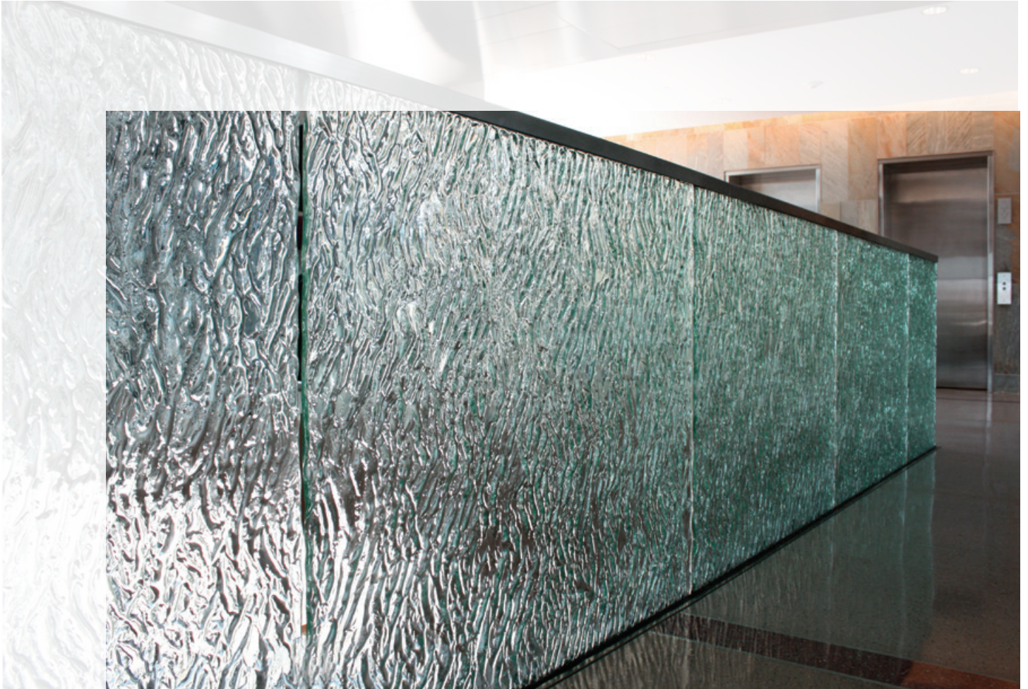
CHANDLER CITY HALL - CHANDLER, AZ - Kiln-Fired Tempered Glass for Interior Railing - Shown in Vertical MD202 Flow 1/2" Clear